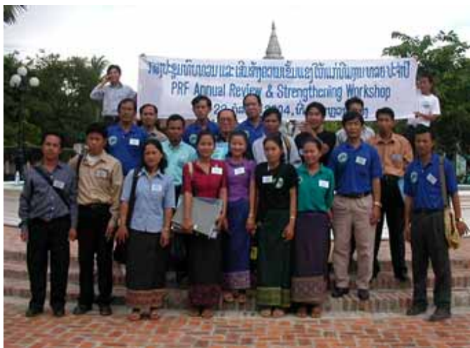
Above: Group photo of some participants

Long but enjoyable and exciting travel from south to north made the PRF staff tired. They were on their way to Luang Prabang, one of the Lao PDR's two World Heritage sites, to learn more about PRF's output and performance in its first year of implementation. The participants came from National Office (Vientiane), Huaphanh, Savannakhet and Champsack and also included some invited guests (government officials) from Luang Prabang Province and national level. At the workshop, the participants shared experiences and lessons learned from past implementation in each province in order to help PRF improve performance in Cycle II. Everyone was very satisfied with the workshop and requested PRF management to organize a similar workshop again. Although all staff are working on the same project, some had never met each other before, so this workshop was an opportunity to bring together all staff so that they could hear and learn from each other. Feedback and proposed solutions from the participants will be used as a reference for future action.